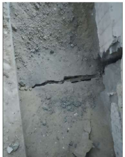
Repair of Building column and beam crack