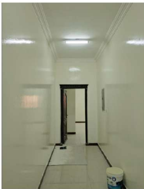
4-story building Painting