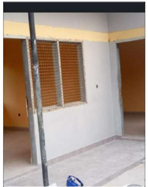
4 Bedroom Full Renovation