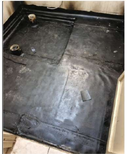
Supervised waterproofing laying