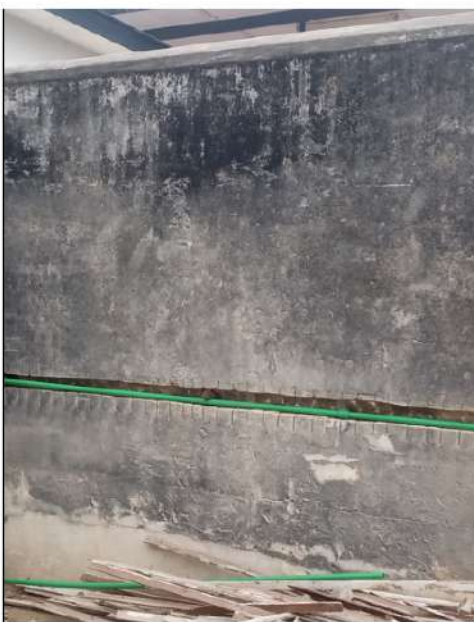
Pipe laying supervision