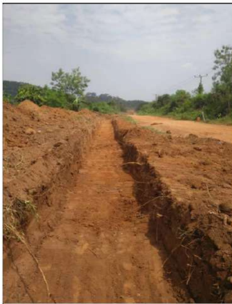
Site engineer- Trench Excavation 0.9 drain